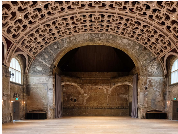
Battersea Arts Centre - Before & After