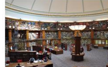
The Picton Reading Room