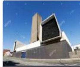
Liverpool Ventilation Shaft