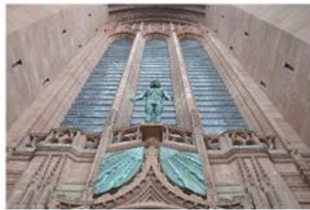
The Anglican Cathedral