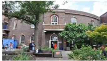
Blue Coat 1700