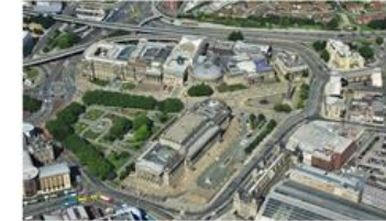
William Brown Street