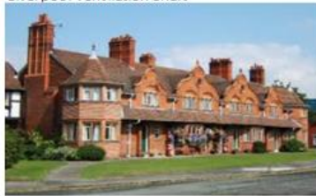
Port Sunlight - Arts & Crafts 1892