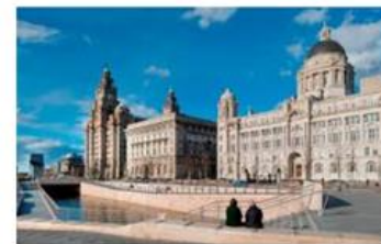
The Three Graces