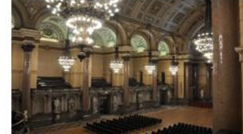
St George's Hall