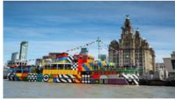
Aloft Hotel - Royal Insurance Building Liverpool Built 1896