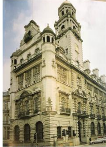
Aloft Hotel - No. 1 N John St, L2 5QW